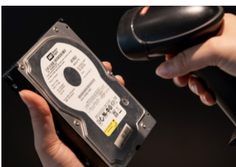
Scans serial numbers of hard disks before erasure