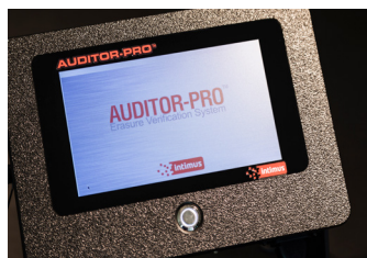
Creates erasure certificates – Touchscreen operation