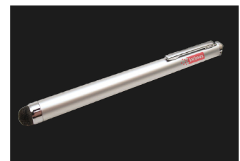
Stylus for comfortable operation of the touchscreen